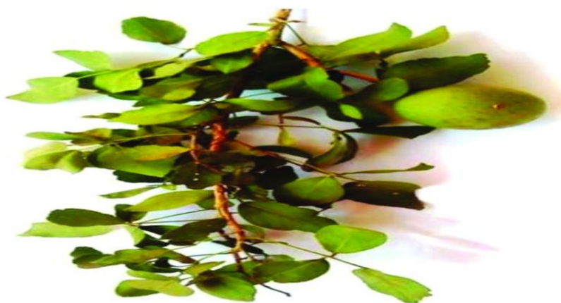
Fig. 1: bael plant with frui.