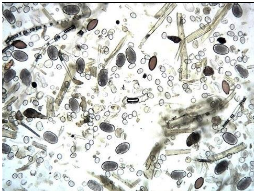
Fig. 1 Egg of different parasites observed in faeces of Cattle. 100X