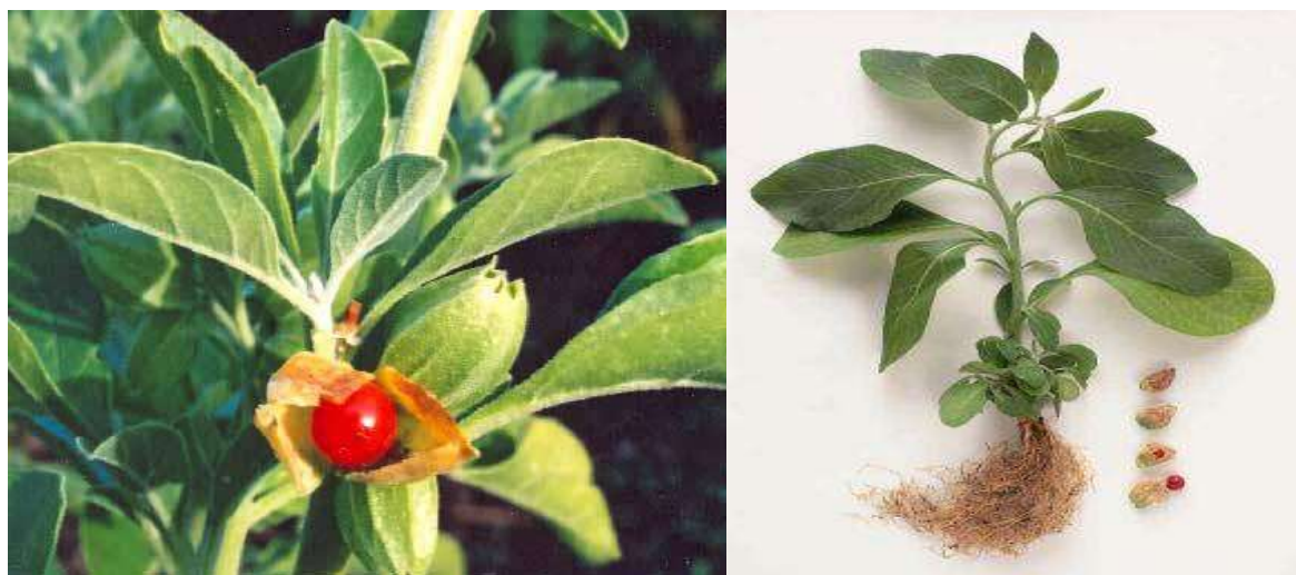
Fig. W. somnifera: