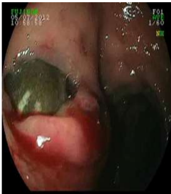
Figure 1: Large ulcer at the front of the bulb with a calculation within it.

Computer tomography (CT), demonstrated a sclerotic, atrophic and multiple gallstones in gallbladder, with a calculation protruding in the duodenum (Figure 2). Several mechanisms have been reported in the literature explaining.