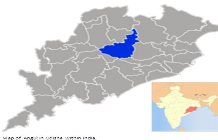
Fig. 1: Map showing sample collection sites.

The present research was carried out in Angul, Odisha India(Figure 1). Angul city is the industrial city in the country with many thermal power plants and financial centre. This city has more than 2.5 million population even though the metropolitan area has a population of 4,009,423 reported India (Figure 1). Angul city is the industrial city in the country with number of thermal power plants and financial centre. This city has more than 12.74 lakhs population even though the reported at the Census of 2011. Poultry eggs and meats occupied a large portion to meet nutrient requirements of these huge population.