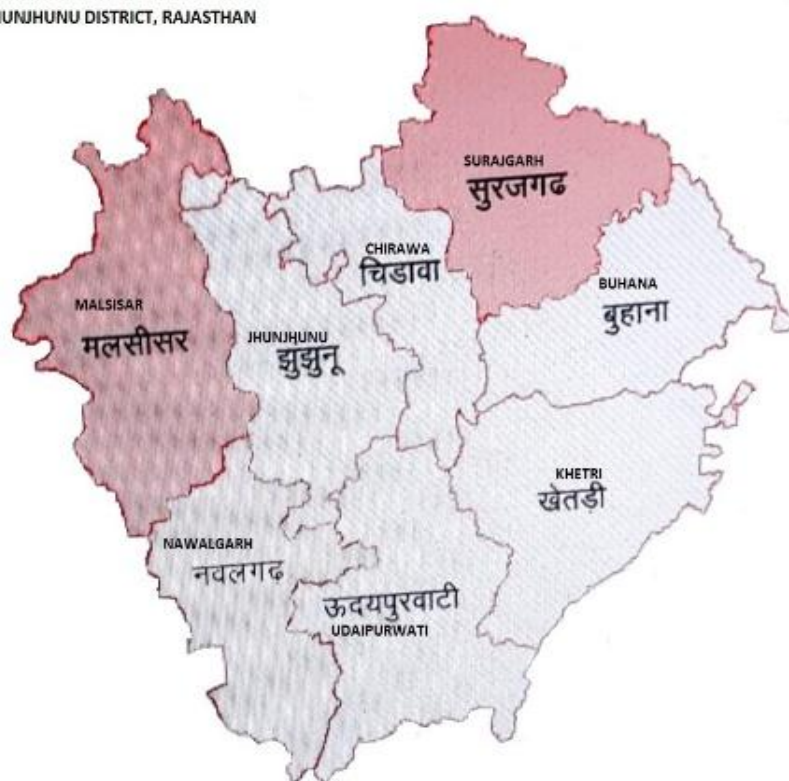
TEHSIL MAP OF JHUNJHUNU DISTRICT, RAJASTHAN

agricultural activities and chemical fertilizer which are made from phosphate and potassium. Fluoride is the most electronegative and reactive of all the element due to its small atomic radius. Its present in 0.06 to 0.09% of weight of the earth crust. It is 13 th most abundant element in the earth's crust. Fluoride play an important role in the mineralization of our bones and teeth, a process essential for keeping them hard and strong. At about 99% of the body's fluoride is stored in bones and teeth. Now a day's higher concentration of fluoride in ground water generated many water problems. Thus, the human beings suffered from several water born disease such as fluorosis of skeleton, dental carries, abnormal origin of teeth, joint pain in people and skin disease. Hence the author has chosen this area for this research.