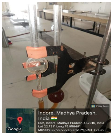
Fig.No.6: Determination of viscosity.