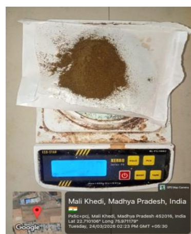
Fig. 1: Dry Powder of Asparagus racemosus . Fig. 2: Dry Powder of Convolvulus pluricaulis