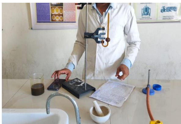
Fig.No.7: Determination of density.