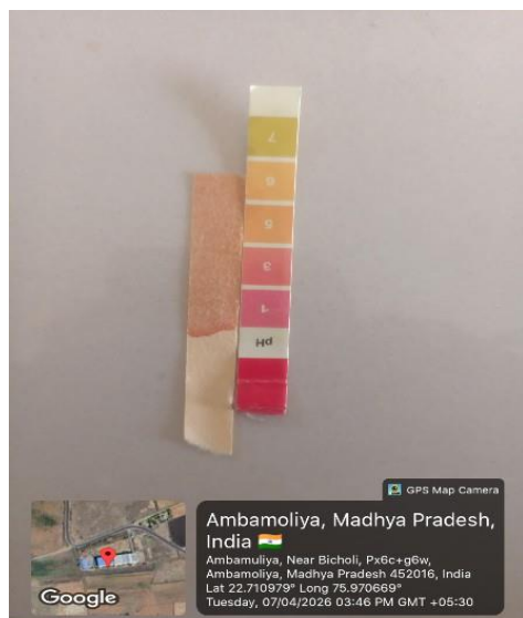
Fig.No.5: Estimation of Ph.