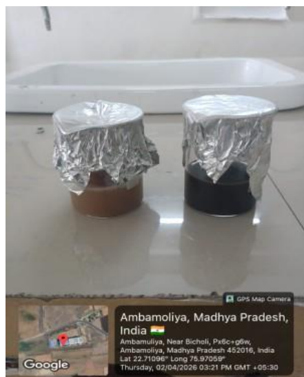
Fig. 3: Decoction method.