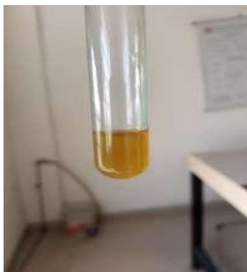
Fig. 4: Solubility of extract c).