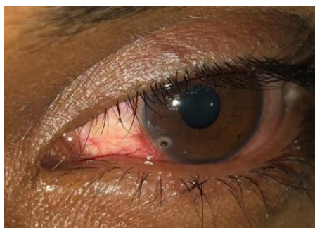
1. Day 1-Before removal of foreign body.