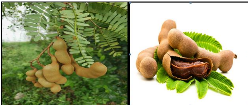
Fig. Tamarind Indica Leaves & Fruits.

Fruit: Brown, straight or curved pod (legume) Pericarp: Hard, brittle outer shell; length: 5–15 cm Pulp: Sweet-sour, sticky, reddish-brown Three to ten firm, glossy brown seeds are found inside the pulp. Odor: A faint, distinctive Taste: Sweet and acidic. [8]