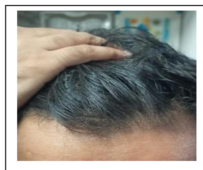
AFTER 30 DAYS