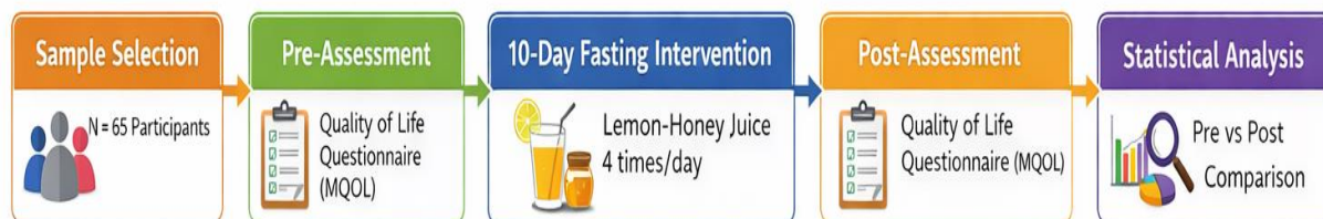
Figure 1: Flow diagram of study design.