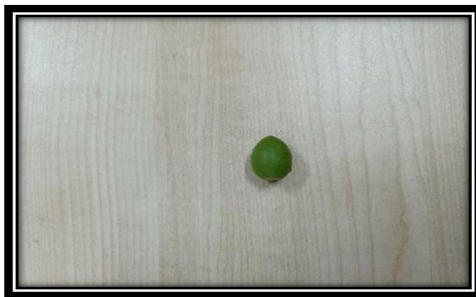
Fig. 1: (Fruit of Elaeocarpus ganitrus . Gaertn).