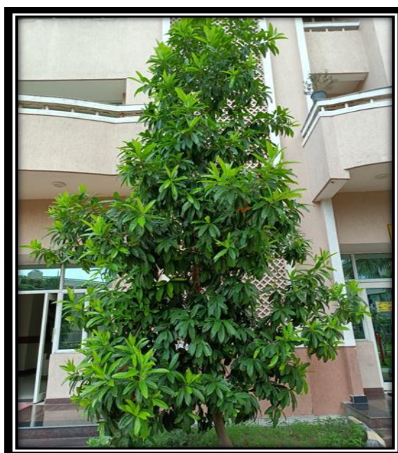
Fig. 3: (Tree of Elaeocarpusganitrus . Gaertn.).