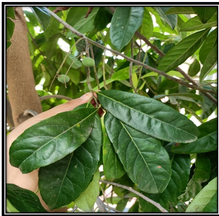
Fig. 4: (Fruit of Elaeocarpus ganitrus . Gaertn).