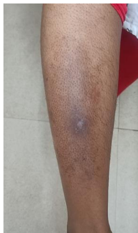
Fig no 4