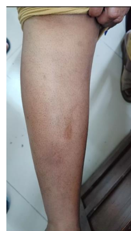
Fig no 7