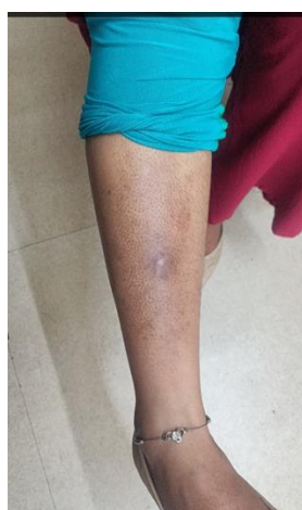
Fig no: 5