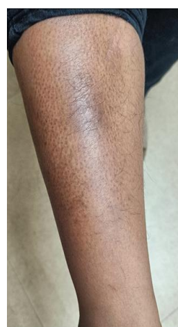
Fig no: 6