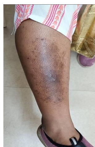
Fig no: 3