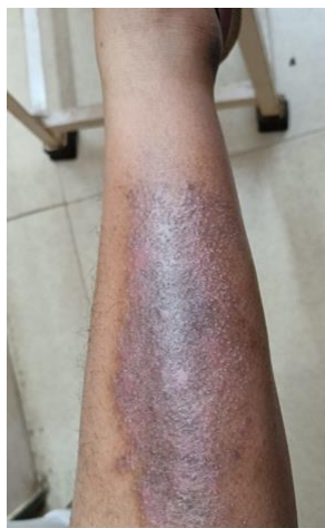
Fig no: 1