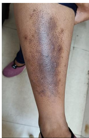
Fig no: 2