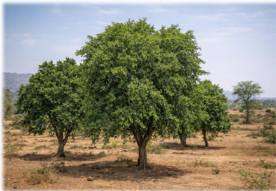
Figure 6: Cordia dichotoma G. Forst in arid landscape.