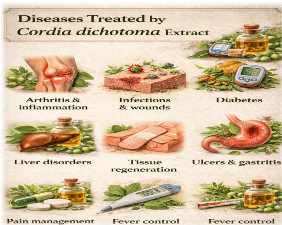
Figure 9: Cordia dichotoma G. Forst extract for health benefits.

Overall, the diverse pharmacological activities exhibited by Cordia dichotoma leaves provide strong scientific evidence supporting its traditional medicinal uses. These findings highlight the plant as a valuable natural resource for the development of novel therapeutic agents, encouraging further research on its pharmacological mechanisms and clinical applications.