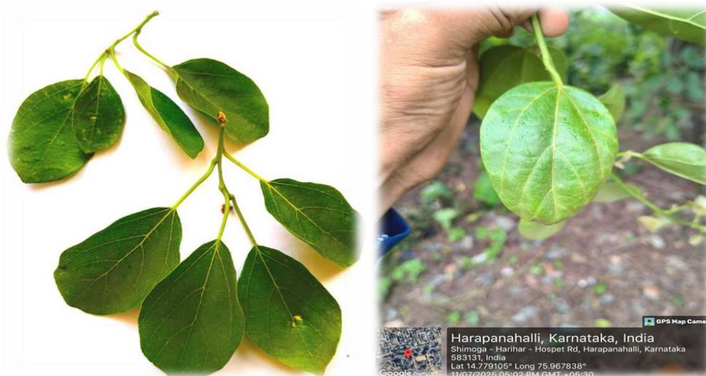
Figure 2: Representation of Cordia dichotoma leaves showing ovate shape, entire margin, and petiole attachment and leaf venation illustrating prominent midrib and reticulate venation pattern.

The leaves are simple, alternate, and broadly ovate to elliptic in morphology, measuring about 8–15 cm in length. They possess an entire margin, acute apex, and a rounded to subcordate base. The lamina is characterized by a slightly rough texture due to the presence of fine pubescence, while the venation pattern is distinctly reticulate with a prominent midrib and lateral veins. These anatomical features contribute to efficient physiological functioning and environmental adaptability.