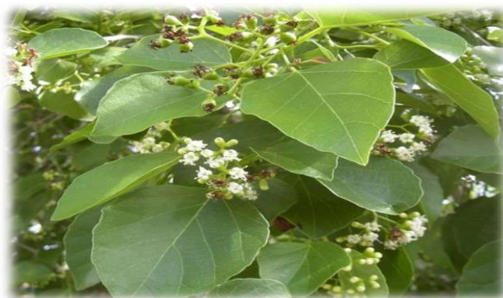
Figure 5: Cordia dichotoma G. Forst Flowers.

The bark is an important diagnostic feature, showing coarse texture and vertical fissures, which can be used for field identification. Overall, the morphological characteristics such as leaf arrangement, venation pattern, and bark texture provide reliable taxonomic markers for the identification of Cordia dichotoma and support its classification within the genus Cordia .