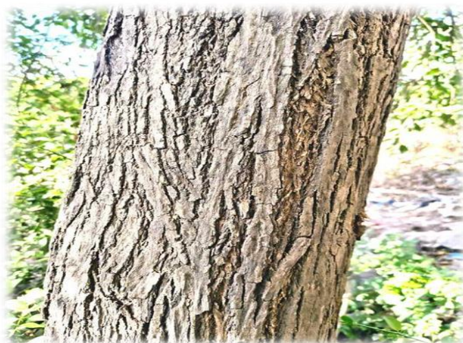
Figure 4: Bark morphology of Cordia dichotoma G. Forst showing rough, fissured surface.

Young leaves appear bright green and smooth, whereas mature leaves become thicker and slightly leathery. The petiole is short but robust, providing mechanical support to the broad lamina. The venation pattern observed in the present specimen confirms its taxonomic placement within Boraginaceae and aligns with previously reported morphological descriptions. The plant exhibits a spreading branching pattern, forming a moderately dense canopy. Leaves are often observed in clusters along young shoots, enhancing photosynthetic efficiency.