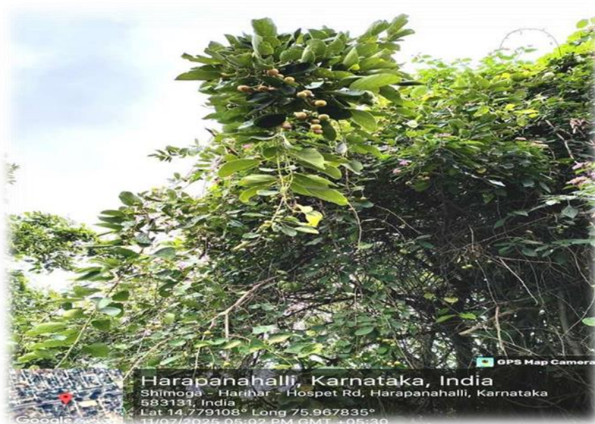
Figure 1: Whole plant morphology of Cordia dichotoma showing natural growth habit and canopy structure (Harapanahalli, Karnataka, India).

Cordia dichotoma G. Forst is a small to medium-sized deciduous tree belonging to the family Boraginaceae, typically attaining a height of approximately 10–15m under favorable ecological conditions. The species exhibits a moderately thick trunk with greyish to brown bark, which becomes rough, fissured, and longitudinally cracked upon maturity, reflecting its adaptation to dry tropical environments.