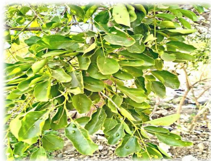
Figure 3: Clustered leaf arrangement of Cordia dichotoma G. Forston young branches.

The leaves are simple, alternate, and broadly ovate to elliptic in morphology, measuring about 8–15 cm in length. They possess an entire margin, acute apex, and a rounded to subcordate base. The lamina is characterized by a slightly rough texture due to the presence of fine pubescence, while the venation pattern is distinctly reticulate with a prominent midrib and lateral veins. These anatomical features contribute to efficient physiological functioning and environmental adaptability.