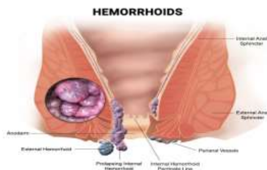
Figure 1: Internal and External haemorrhoids.