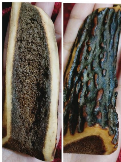
Figure 1: Images of Deer Antler Velvet showing front (inner surface) and back (outer surface) views.

Thus, the purpose of this review paper is to investigate conventional assertions and evaluate the available scientific data regarding the pharmacological characteristics and prospective therapeutic applications of materials composed of deer antlers.