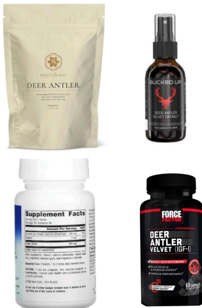
Figure 3: Image showing different market forms of Deer Antler Velvet (capsules/tablets, powder/extract, and liquid/spray).