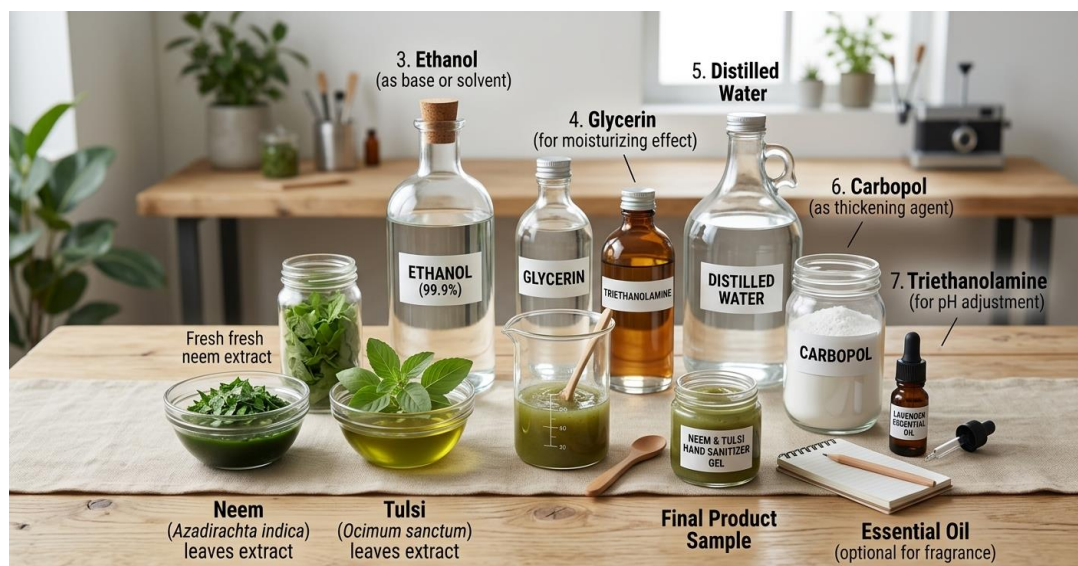
Fig. No. 2: Experimental Setup and Ingredients for Neem & Tulsi Herbal Hand Sanitizer Formulation.