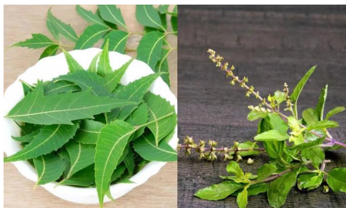
Fig. No. 1: Neem and Tulsi Plant.

This study focuses on the preparation and evaluation of a herbal hand sanitizer using Neem and Tulsi extracts. [5] The aim is to develop a safe, effective, and eco-friendly product that can be used as an alternative to chemical-based sanitizers for daily hand hygiene.