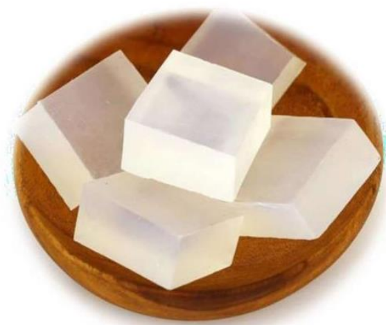
Fig 2.5 Base Glycerine Soap