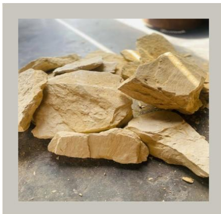
Fig no. 2: Multani mitti.