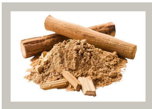
Fig. no. 3:- Sandalwood Powder.