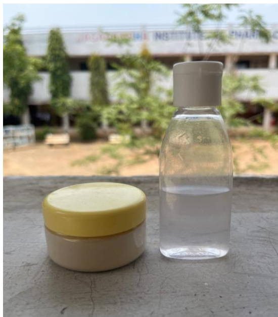
Fig. no. 10: Final batch.