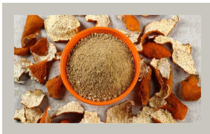
Fig. no. 4:- Orange peel powder.