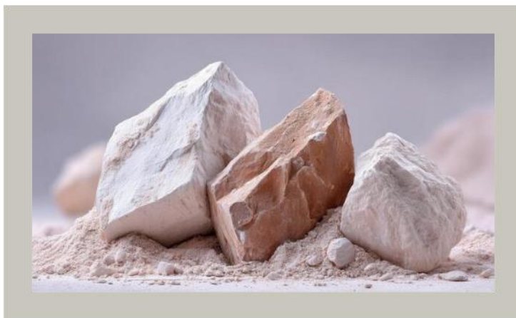
Fig. no. 6:- Kaolin clay.