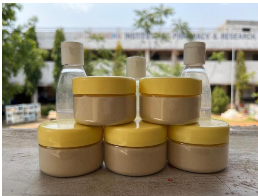
Fig. no. 9: Different batches.

Batch F3 showed lower pH, which may cause slight skin irritation compare to other formulation.