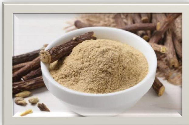
Fig. no. 5:- Licorice powder.