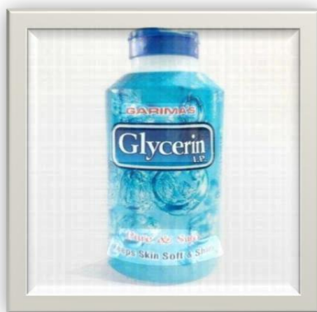
Fig. no. 8: Glycerine.