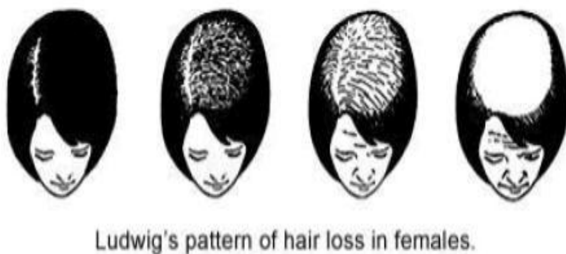
Figure 1: Hair loss affects the genders in women.