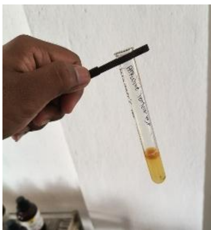
Figure 4: Alkaline Reagent Test for Cedarwood oil.