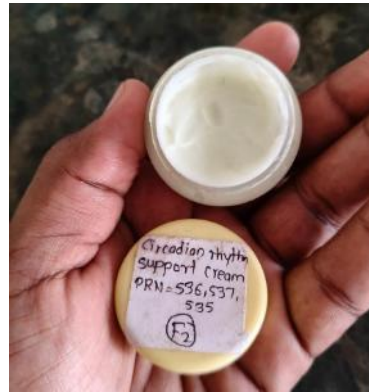
Figure 27: Phase Separation Test.

11. Stability Study: The prepared cream was stored in suitable containers at different temperature conditions. Samples were observed for changes in colour, odour, and appearance. The formulation was checked periodically for phase separation and consistency. pH and viscosity were also evaluated during the study period.