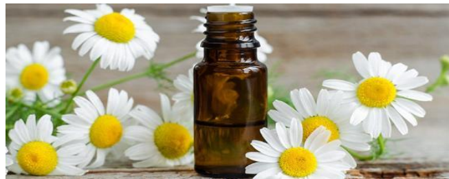
Figure 3: Chamomile oil.