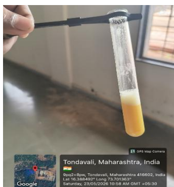
Figure 12: Test for Saponin for cedarwood oil.