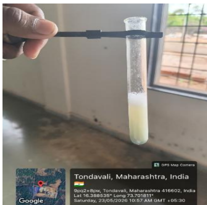
Figure 13: Test for Saponin of chamomile oil.