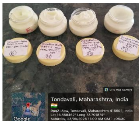
Figure 28: Stability Study.