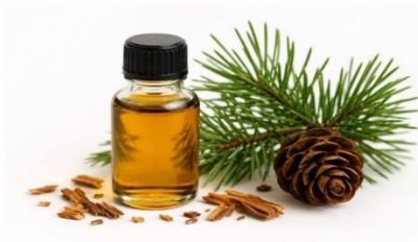
Figure No. 2: Cedarwood oil.