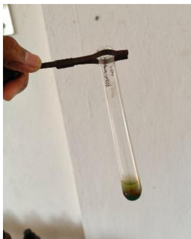
Figure 5: Alkaline Reagent Test for Chamomile Oil.