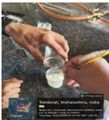
Figure 16 Fusion Method.