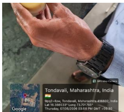
Figure 23: Washability.

7. Irritancy Test: Select a healthy skin area (e.g., inner forearm). Clean the area with water and allow it to dry. Mark three separate sections on the skin and label them as F1, F2, and F3. Apply a small quantity of each formulation on the respective marked area. Spread gently to form a thin film. Leave the application undisturbed for 24 hours. After 24 hours, observe each area for: No erythema, redness, Swelling, Itching, or any irritation. Record the observations.