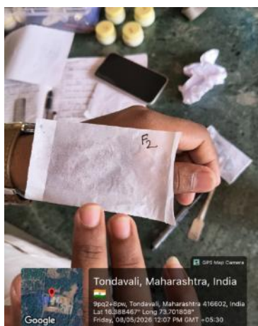
Figure 26: Greasiness.

10. Phase Separation Test [14] : The formulated cream was kept intact in a closed container at 35°C not exposed to light. Phase separation was observed every 24 hrs for 30 days. Any change in phase separation was checked.