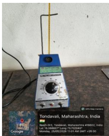
Figure 22: Melting point.