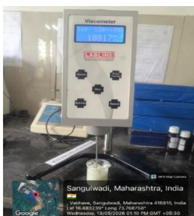
Figure 21: Viscosity.