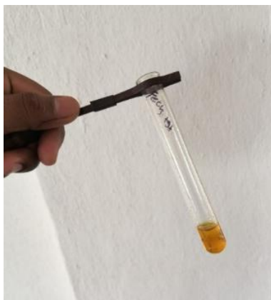
Figure 10: Ferric Chloride Test for cedarwood oil.