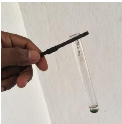
Figure 8: Mayar's test for chamomile oil.