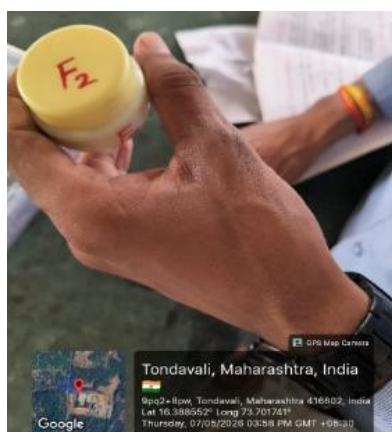
Figure 24: Irritancy Test.

8. After Feel Test: Emolliency, slipperiness and amount of residue left after the application of the fixed amount of cream were found to be good.