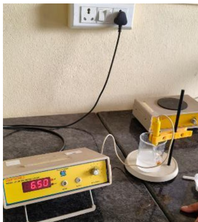
Figure 19: pH Determination.