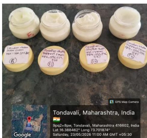
Figure 18: Physical Evaluation.