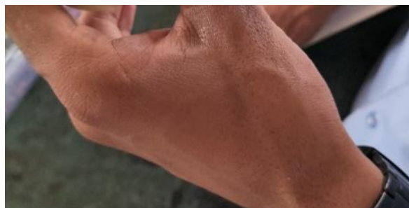
Figure 25: After Feel Test.

9. Greasiness: The cream was applied to the skin surface as a smear, and its texture was evaluated to determine whether it was oily or greasy.