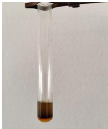
Figure 15: Salkowski test for chamomile oil.