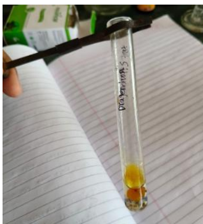
Figure 7: Dragendorff's test for cedarwood oil.