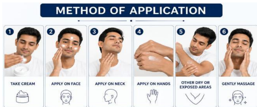
Figure 17: Method of Application.