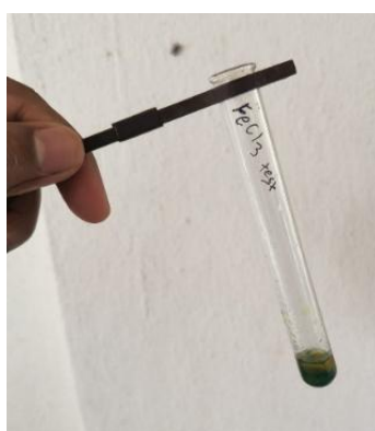
Figure 11: Ferric Chloride Test for chamomile oil.