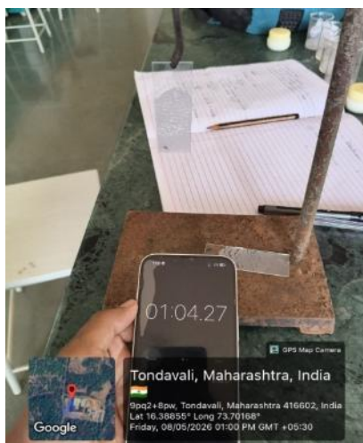
Figure 20: Spreadability.