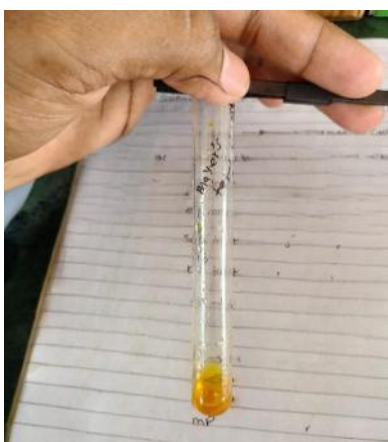
Figure 6: Mayer's test for Cedarwood oil.