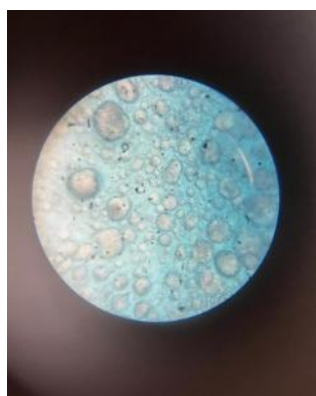
Figure 29: Type of Emulsion Test.