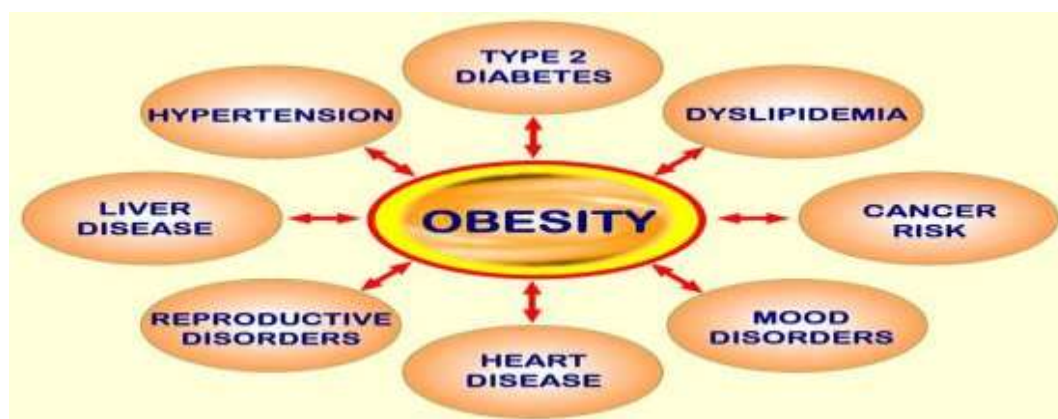
Fig No 2: Co-Morbidities associated with obesity.