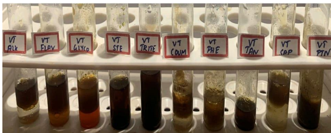
Figure 1: Phytochemical analysis of Vetrilai thylam.